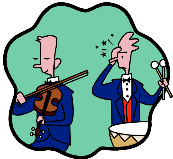
Patience: It’s the key!